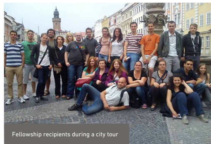
Fellowship recipients during a city tour