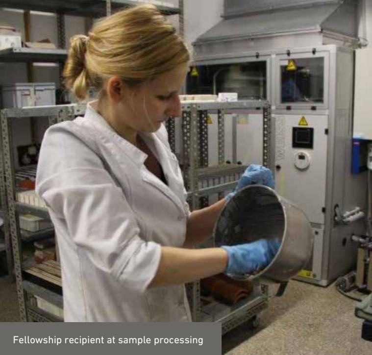
Fellowship recipient at sample processing