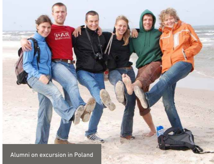
Alumni on excursion in Poland

During the fellowship practical solutions for current environmental issues are developed. After their stay in Germany the alumni are well qualified to tackle these issues in their home countries thus assuring efficient knowledge transfer. Working closely together in an international context helps to breakdown existing barriers. The acquired contacts will create a strong network of highly committed environmental experts.